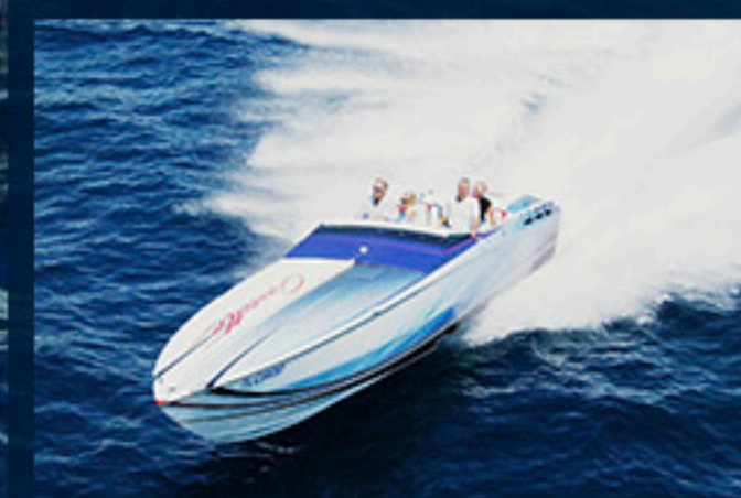
Lorem Ipsum 55