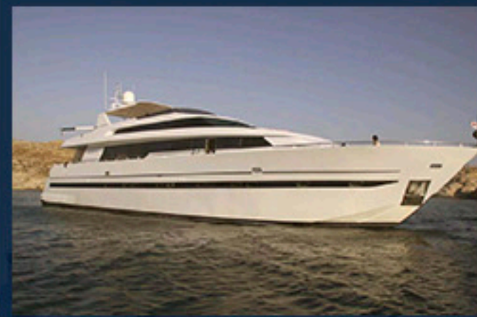
San Lorenzo 88