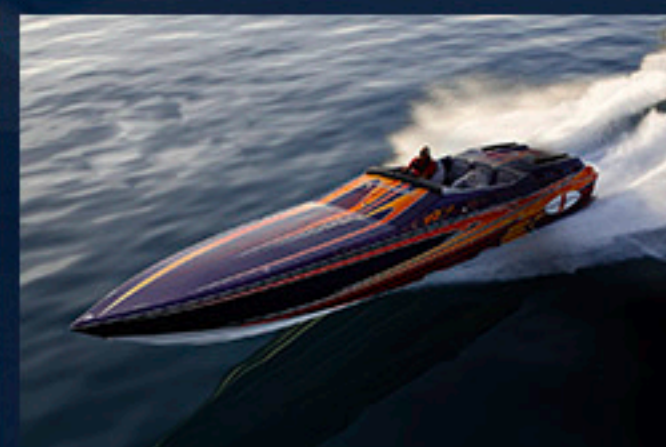
Offshore / Racing