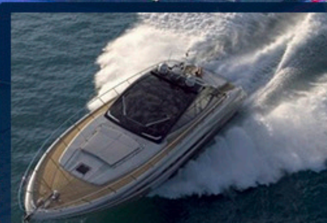
Riva Vertigo 63