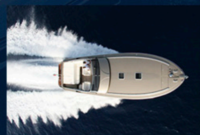
Otam 45 Heritage