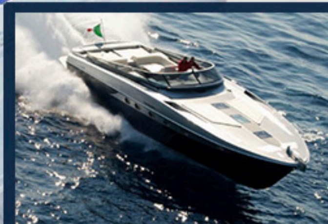
Otam 58 Millennium Open