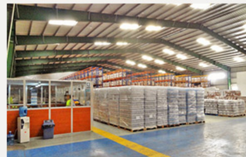
Warehouse located in Monrovia Free Port area