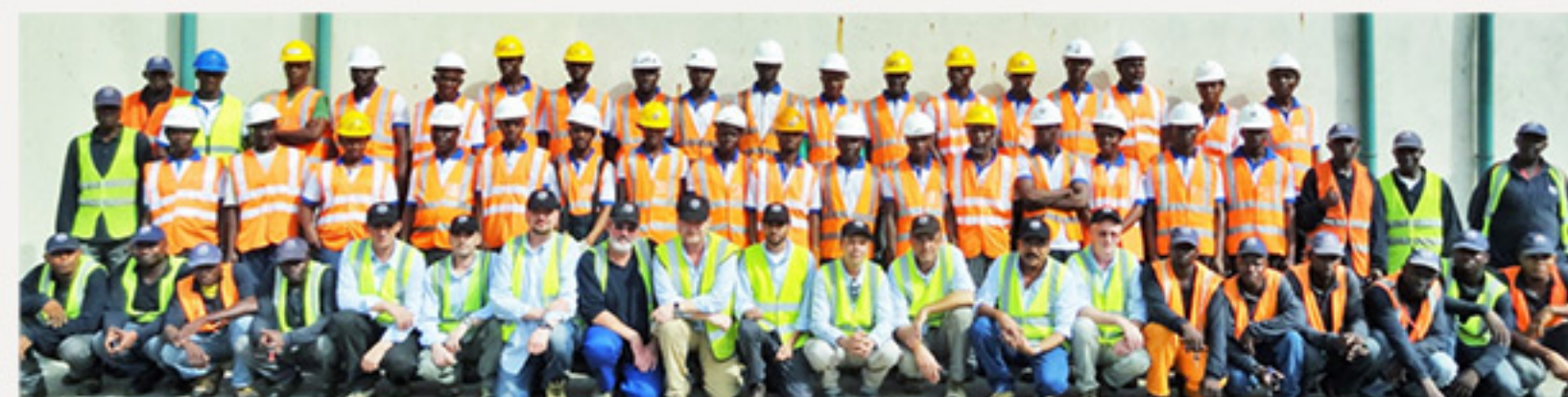
Over 60 Employees Recruited Locally