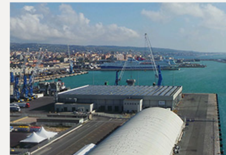
Our warehouse (16 000 sqm) in Civitavecchia, Italy.

Whether it is our warehouse (16 000 sqm) in Civitavecchia, Italy, located 30 meters from two quaysides (pier 24 and 25) and capable of handling two vessels simultaneously with special pallets for quick turnaround,