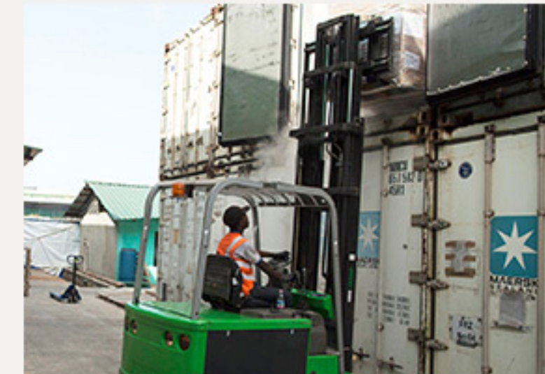
An EFS employee unloading a container

EFS stands out because of our quality assurance driven team operates to the highest ethical standards based on a transparent culture to provide a first class service whatever the challenges or conditions. All Operations are ISO 9001:2008 certified and EFS is also ANAB accredited.