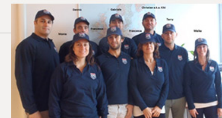
Experienced Expat Team in Liberia