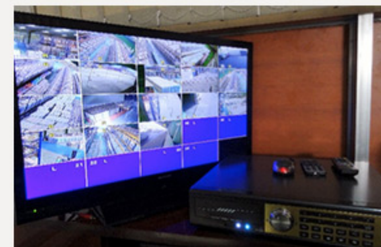
Private 24hour Security, Private EFS gated entry for 24 hour access and CCTV Monitoring System