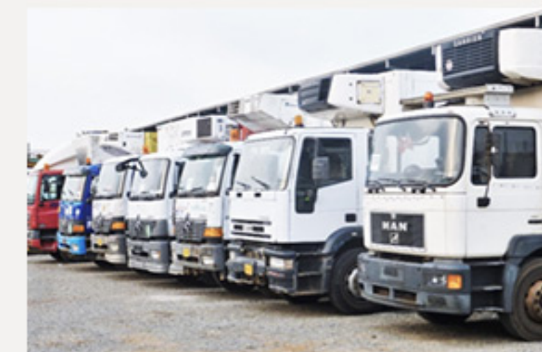
8 Delivery Vehicles on Rotation, 4 Temperature Controlled, 2 Standby Trucks